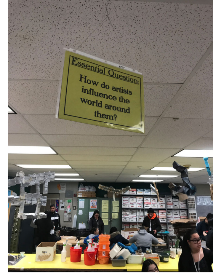
A sign posted in an art class at Revere High School.